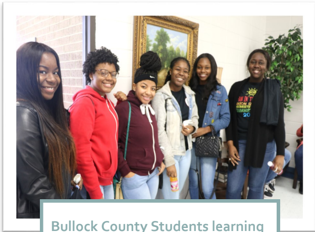
Bullock County Students learning together.

Upward Bound students were able to enjoy a cloudy day in Dothan, Alabama on Saturday, January 19 th . Our First Annual TRIO UB Career Day was a tremendous success. Participants were greeted on campus and enjoyed juice and freshly made donuts. The opening session provided an overview of what was to come. Rotating workshops included: Too Legit to Quit (Two-year vs. Four Year Colleges), Money in the Bank (Financial Literacy), Tunnel Vision (Goal Setting), and Securing the Bag (Confidently Choosing a Career).